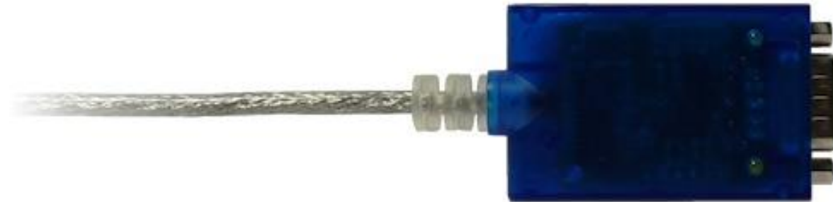
CANdo Interface – Top View

The CANdo Interface is a compact USB to CAN interface that connects between a PC & an embedded CAN bus.